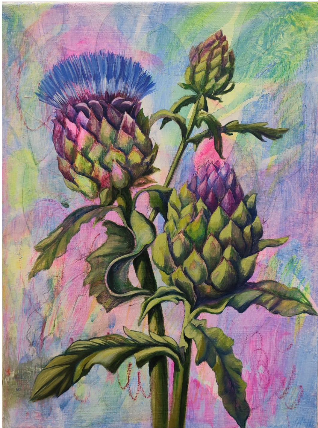
Eliza Wiszniewska, Divine Cynara , Mixed media on canvas, 2023, 39,5 x 29,5 cm