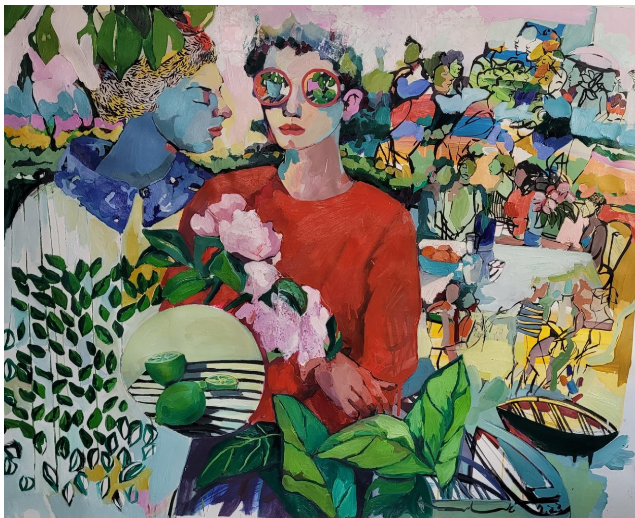
Golnaz Afraz, Miroir du Passé , Oil and acrylic on canvas, 2023, 100 x 120 cm