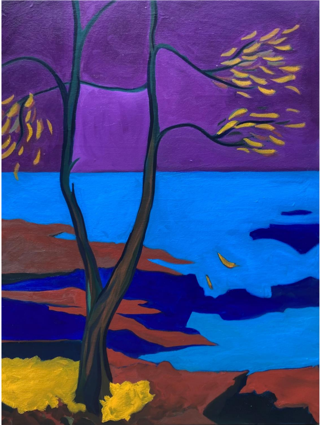
Henry Glover, For a Reason , Oil on canvas, 2022, 80 x 60 cm