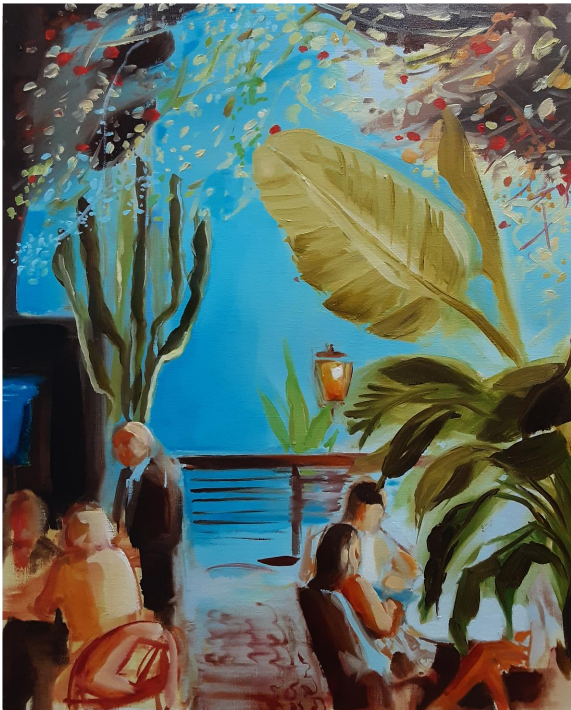
Eugenia Cuellar, Beach Club , Oil on linen, 2023, 56 x 45 cm