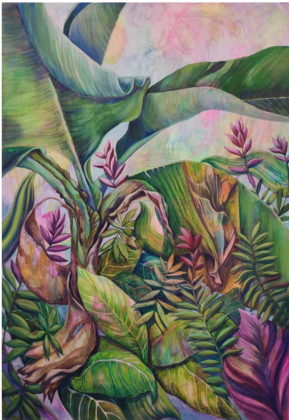
Eliza Wiszniewska, My memories will not fade away , Mixed media on canvas, 2023, 100 x 70 cm