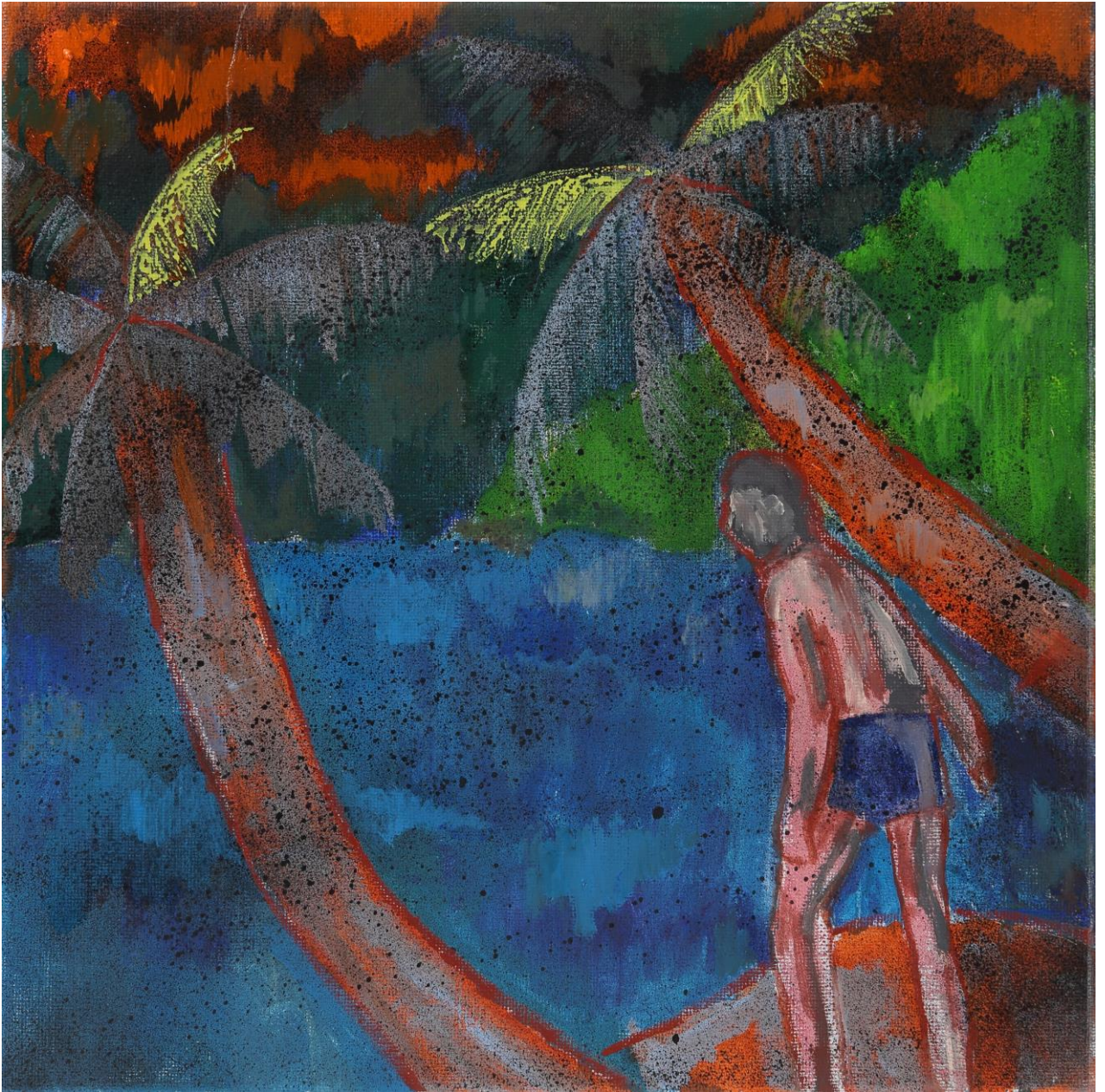
Taedong Lee, Ocean Front , Acrylic and Oil on canvas, 2021, 30 x 30 cm