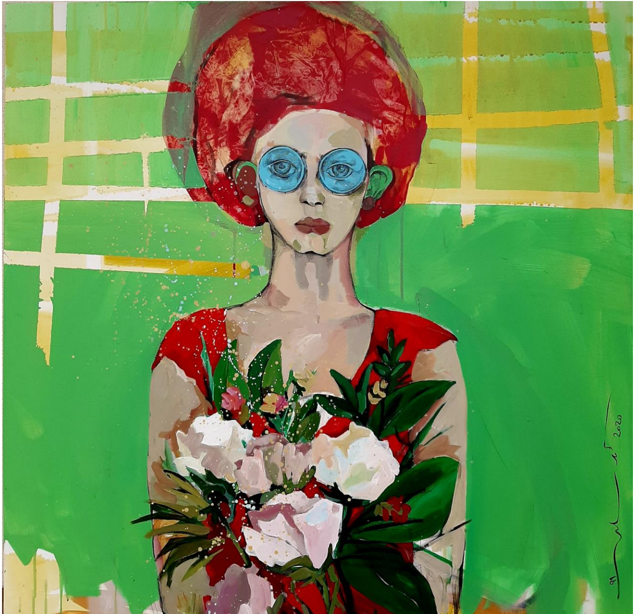
Golnaz Afraz, Woman in Red , Oil and acrylic on canvas, 2020, 100 x 100 cm