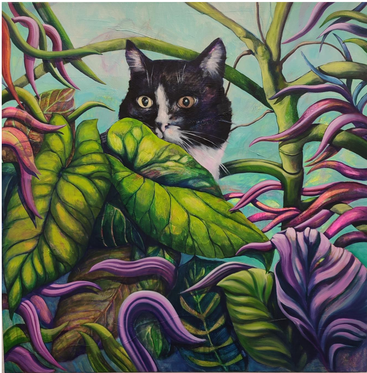
Eliza Wiszniewska, Cat me if you can , Mixed media on canvas, 2023, 80 x 80 cm