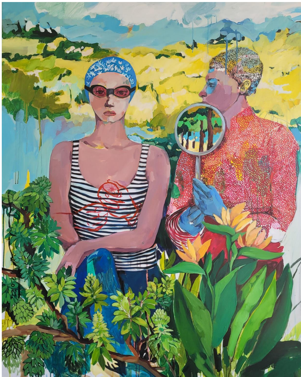
Golnaz Afraz, Le reflet des pensées , Oil and acrylic on canvas, 2023, 140 x 112 cm