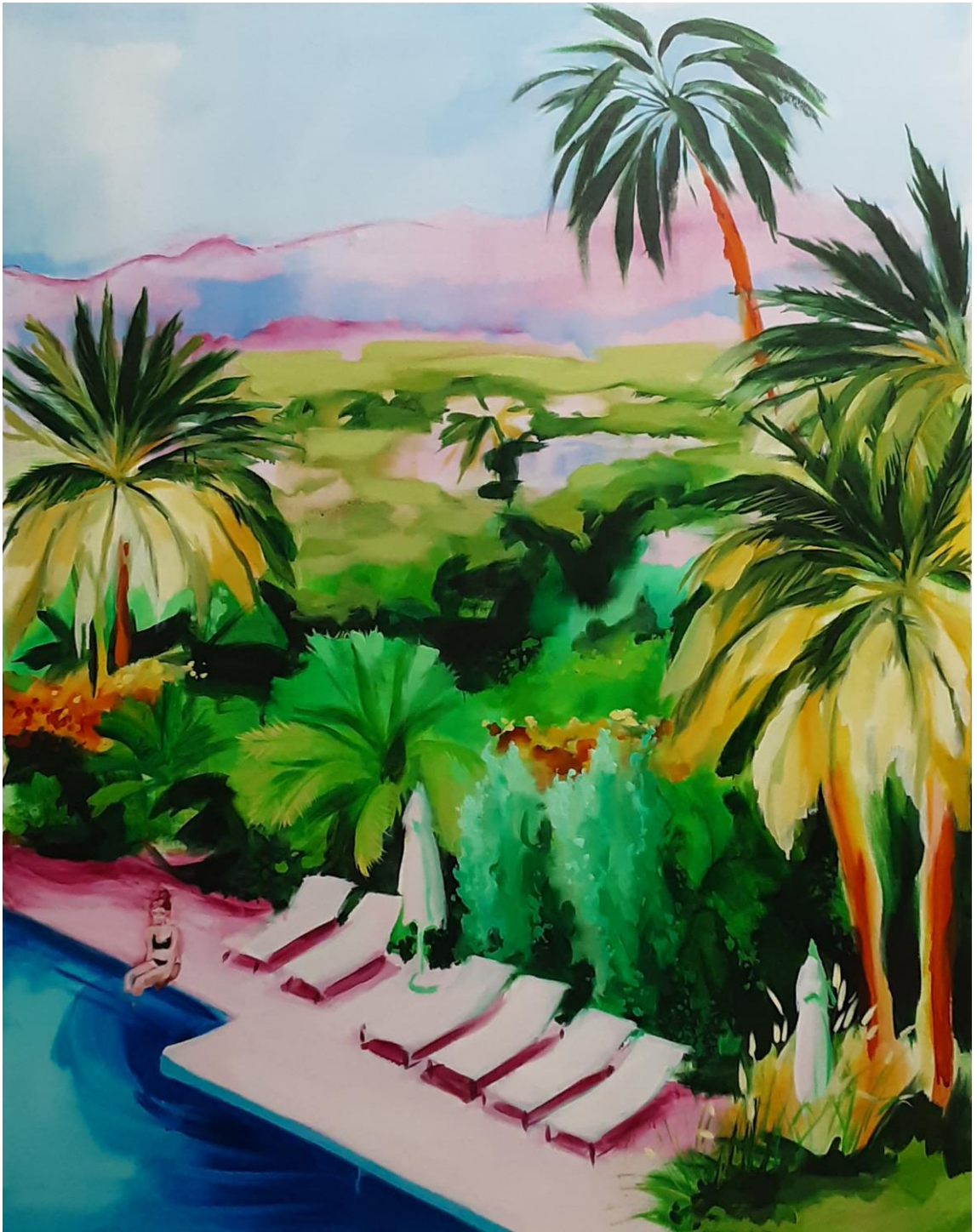
Eugenia Cuellar, Bright Star , Oil on linen, 2022, 146 x 114 cm