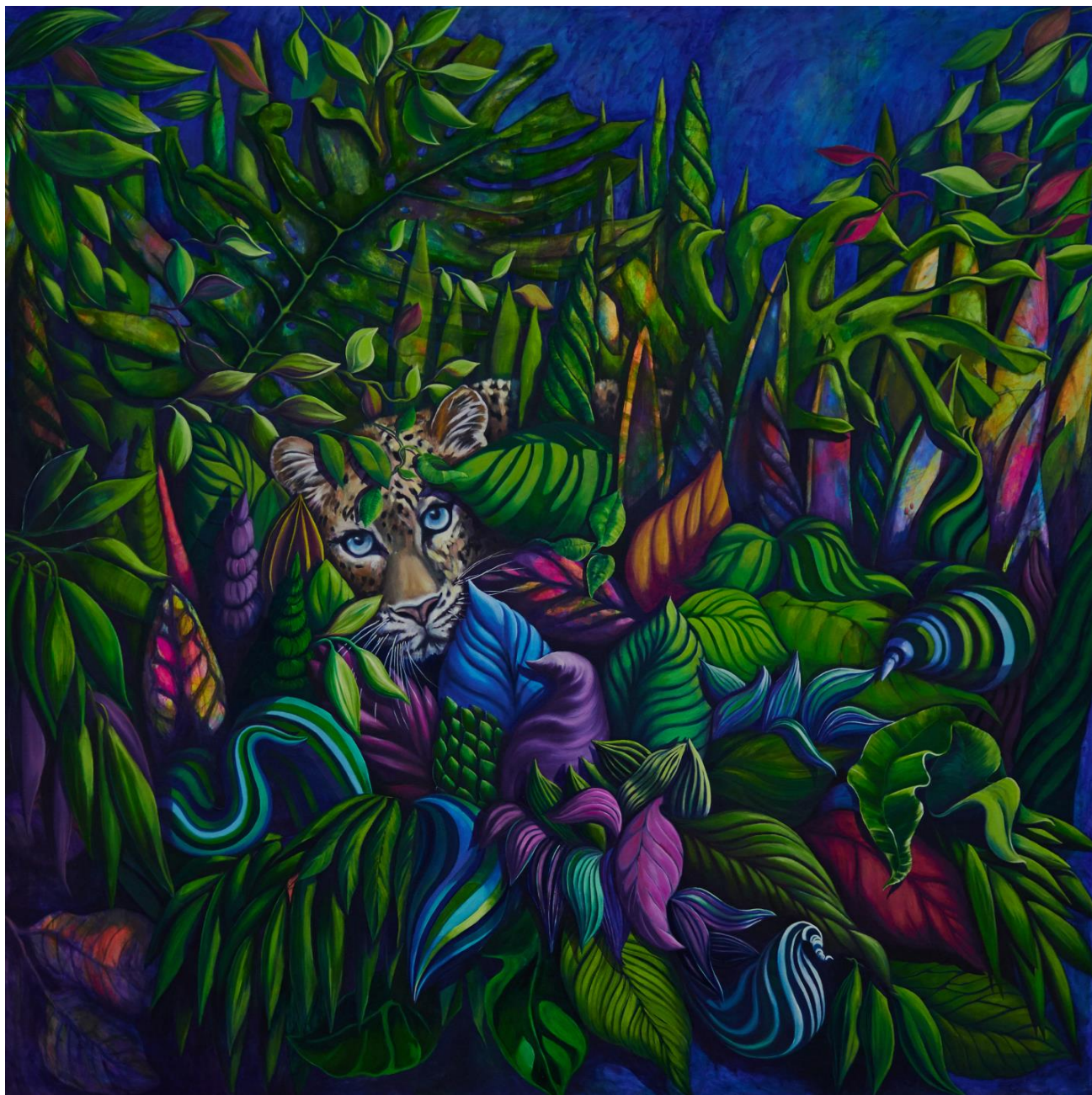
Eliza Wiszniewska, Let's get lost in the wild , Mixed media on canvas, 2022, 135 x 135 cm