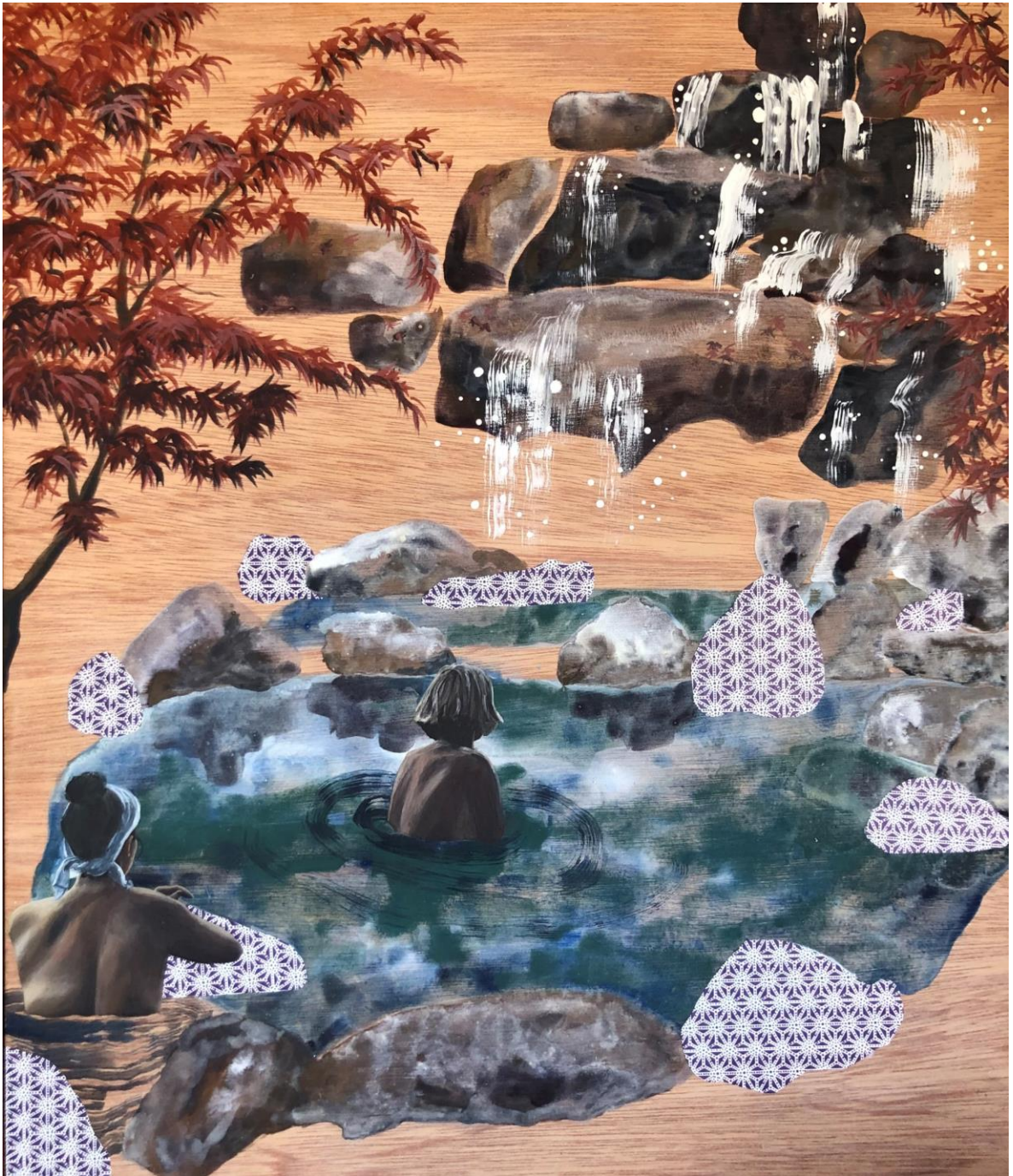
Mia Takemoto, Goshono-yu , Tempera and origami paper on wood, 2023, 53 x 46 cm