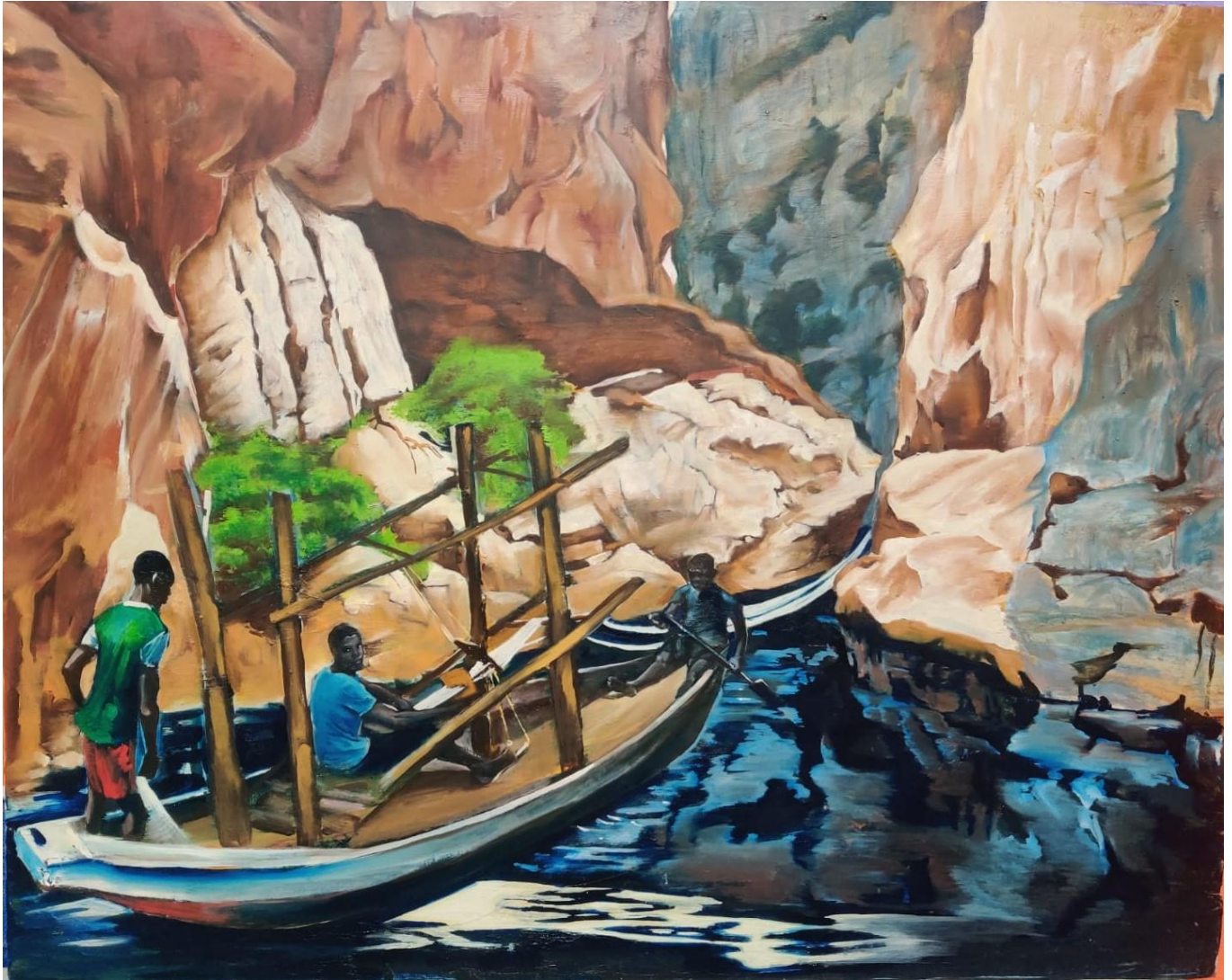
Thibaut Bouedjoro-Camus, Hidden Horizon , Oil on canvas, 2023, 81 x 65 cm